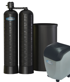
POE & POU Water Softeners

KineticoPRO offers a complete range of commercial water treatment solutions. Based on a per-location water analysis, we will work with you to prescribe the ideal water filtration, softening and reverse osmosis solutions to optimize your water quality and protect your equipment.